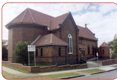
Corpus Christi Church Platt Street Waratah Est. 1917