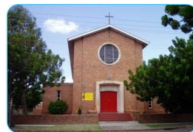
St Therese's Church Royal Street New Lambton Est. 1954

◆ OUR LORD JESUS CHRIST, KING OF THE UNIVERSE ◆ YEAR B ◆ 25 NOVEMBER 2018 ◆